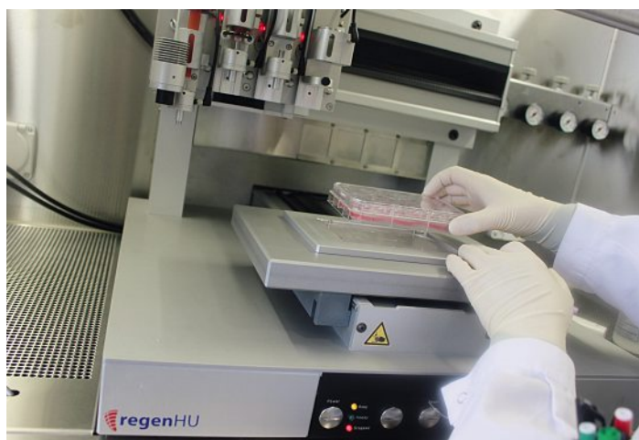
3D bioprinting of skin models: Layer-by-layer production of skin enables dermis and epidermis to be created rapidly and precisely, with an OCT camera ensuring in situ quality control.